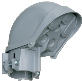
PVC105, PVC106, & PVC129