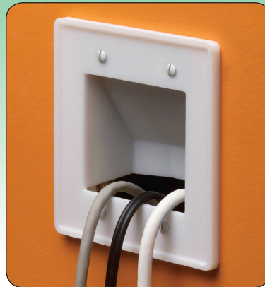
CE2 with SCOOP facing IN