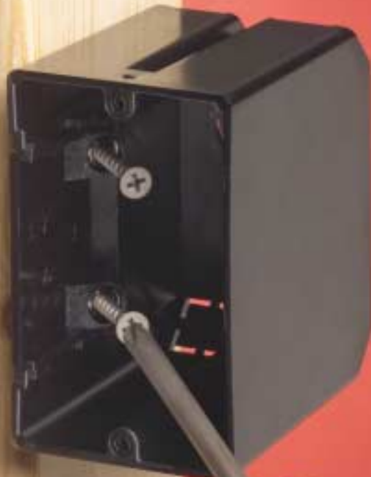
F101 The Versatile Outlet Box

The Versatile Outlet Box for New or Old Work