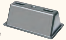
RTSB409 9"w x 4"h