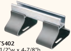
RTS402 9-1/2"w x 4-7/8"h