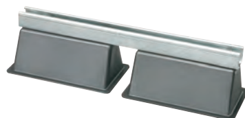
RTS421 21"w x 5-5/8"h