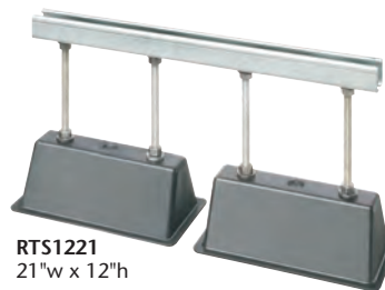
RTS1221 21"w x 12"h