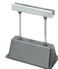
RTS12 9"w x 12"h