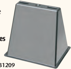
Base only "B" series RTSB1209 9"w x 10-3/8"h