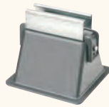
RTSE405 5"w x 5-5/8"h