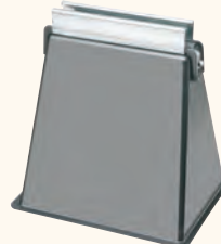
RTSE1209 9"w x 12"h