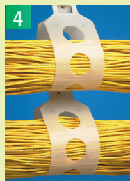
4) Stacked parallel mounting