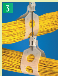
3) Stacked perpendicular mounting