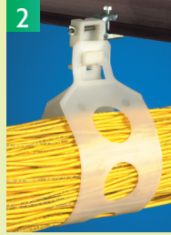
2) Single LOOP mounted perpendicular to beam.