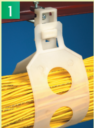
1) Single LOOP mounted parallel to beam.