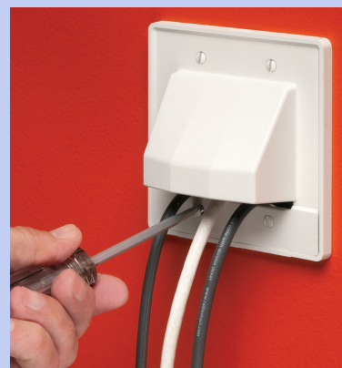
CER2 with Scoop facing OUT. Lower plate secured.

Each of our SCOOPs mounts directly to the wall with drywall screws. For added support mount to one of Arlington's low voltage mounting brackets; LV1 to LV4.