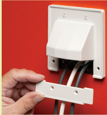
CER2 with Scoop facing OUT. Lower plate removed.