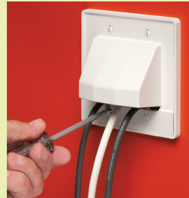
CER2 with Scoop facing OUT. Lower plate secured.

Each of our SCOOPs mounts directly to the wall with drywall screws. For added support mount to one of Arlington's low voltage mounting brackets; LV1 to LV4.