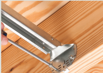
Bracket mounts securely to joists.