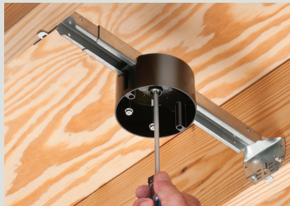
Loosen center screw to position box on bracket.