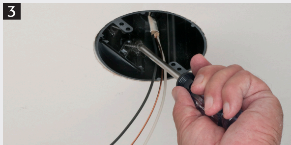
3 Mount box to side of joist using the supplied captive installation screws.