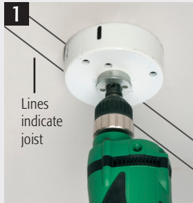
1 Determine box location. Locate joist. Make opening next to it.