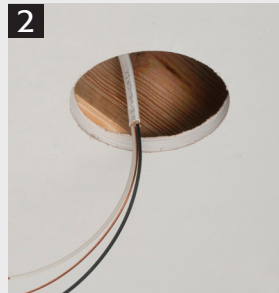
2 Pull cable...