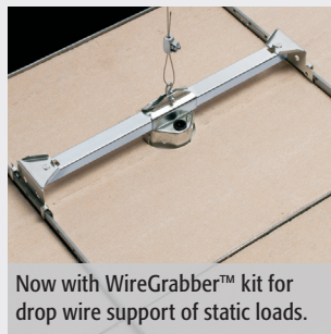
Now with WireGrabber™ kit for drop wire support of static loads.