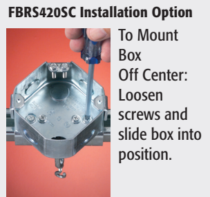
FBRS420SC Installation Option

To Mount Box Off Center: Loosen screws and slide box into position.