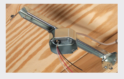
Bend bracket along the score lines for 3/4", 1", or 1-1/4" ceiling depths!

Mounts easily and securely between joists, adjusts from 16" to 24" o.c.