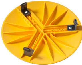
HC3792 (With clips installed)