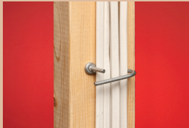
7/8" Drive Ring with non-metallic sheathed cable