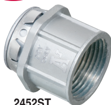
2452ST Fits 1" knockout, 1" threaded pipe/hub

Easy Installation of ADDITIONAL Conduit or Cable in a Tightly Spaced Panel, Box or Enclosure