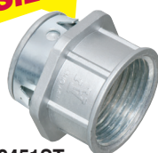
2451ST Fits 3/4" knockout, 3/4" threaded pipe/hub