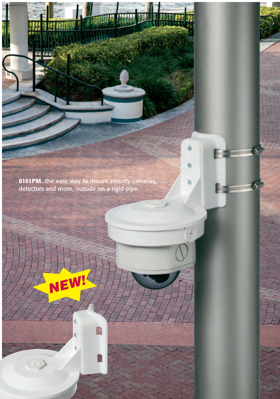
8161PM...the easy way to mount security cameras, detectors and more, outside on a rigid pipe.

For Outdoor Security Camera, Electrical Accessories Installations