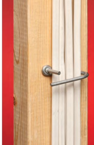
DR3 7/8" Drive Ring with twenty cables