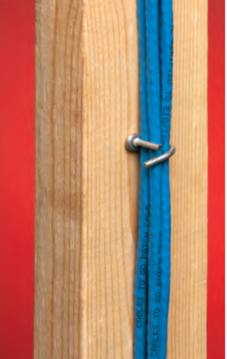
DR1 1/2" Drive Ring with four cables