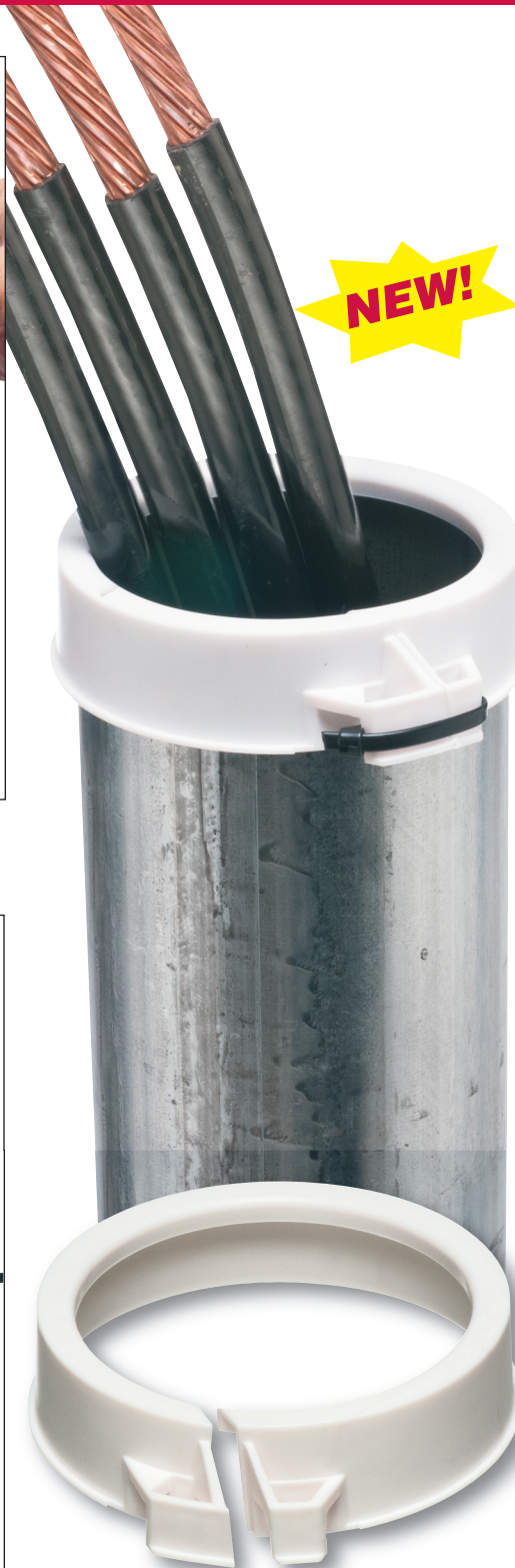
EMT400S 4" Split Insulating Bushing *Cable tie included

Arlington's non-metallic Insulating Bushings protect cable from abrasion when using EMT, Rigid, IMC or PVC rigid conduit – holding firmly in place as cable is pulled through.