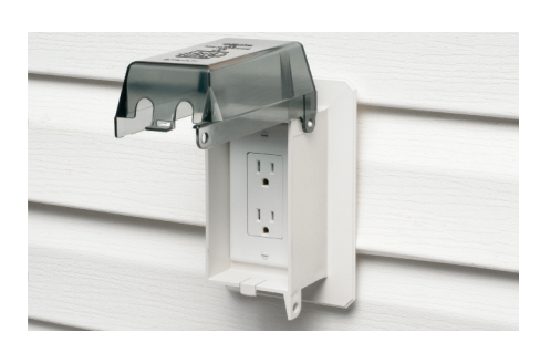
4 Install the single-gang device, then the cover plate.