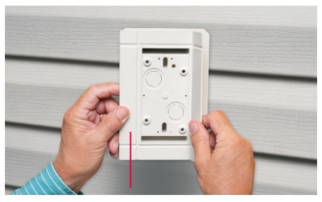
Break the flanges off of the back of the box. Remove knockout. Insert supplied connector and pull cable.