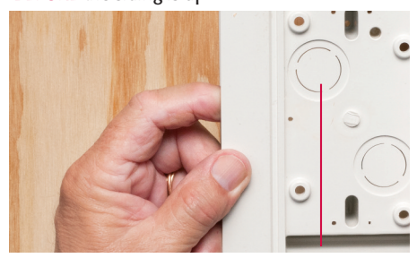
Disconnect electrical power. Remove knockout and insert supplied cable connector. Pull NM cable through connector.