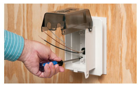
2 Attach box to substrate with screws.