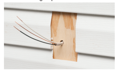
1 Disconnect electrical power. Cut hole in siding.