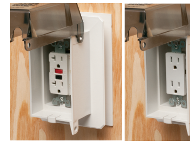
3 Install device, then the cover plate. The F8091 series works with GFCIs and most other single-gang devices. After siding is installed, caulk as required.