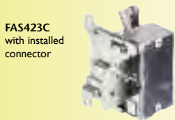
FAS423C with installed connector