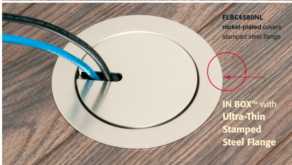
FLBC4580NL nickel-plated covers stamped steel flange