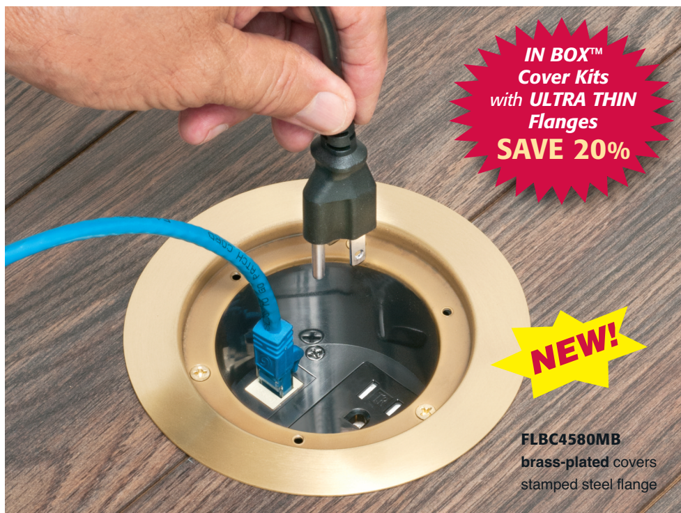
FLBC4580MB brass-plated covers stamped steel flange