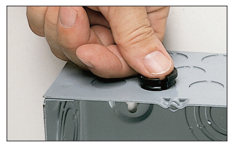
1 Push the NM cable connector into the knockout with light finger pressure.