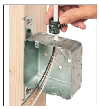
Push assembly through knockout...