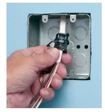
Push assembly into box...