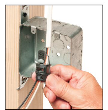
Feed cable into connector.