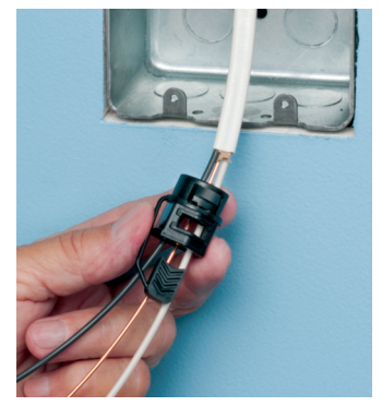
Feed cable through the knockout, then into the connector.