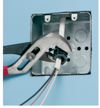
Insert wedge in slot in connector. Lock tight with pliers.