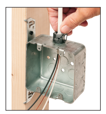
...and push into box. Done!