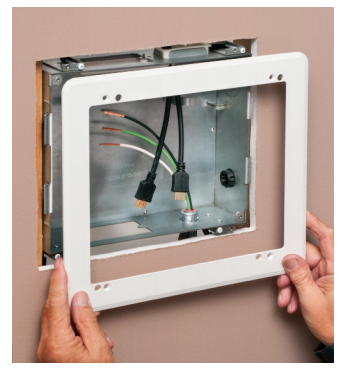
Attach plastic, paintable trim plate with screws provided.