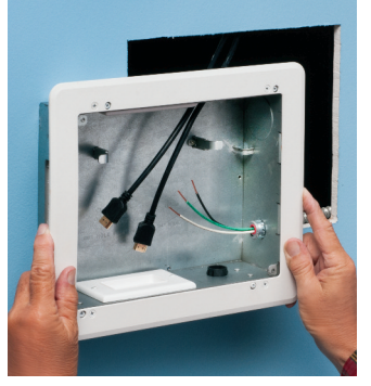
Install trim plate on box. Pull wire. Insert assembly into opening.