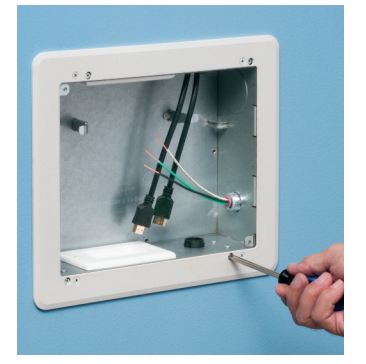
Pull cable. Tighten mounting wing screws to pull box securely against wall.