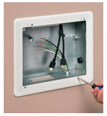
Tighten mounting wing screws to pull box securely against the wall.