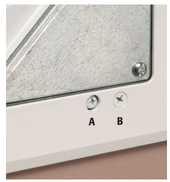
A Mounting wing screws (inside set) B Trim plate screws (outside set)