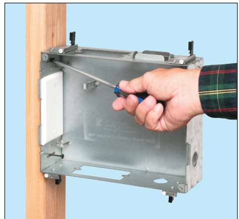
Mounts to stud in NEW work