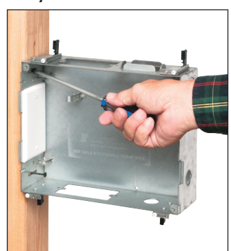
Mount box to stud, using tabs for proper positioning.