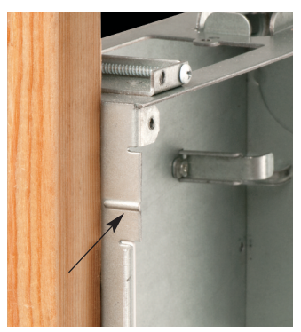
Positioning tabs are set for 1/2" or 5/8" drywall.