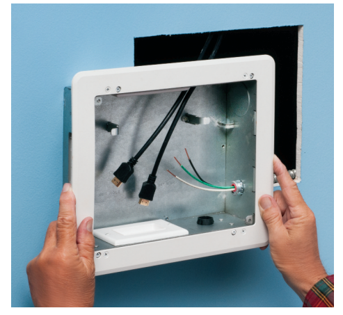
In RETROFIT mounting wing screws hold box secure in wall