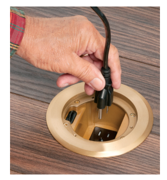
4 Remove blank cover to use receptacle.