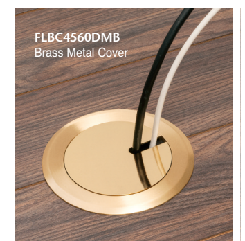
5 Install the slotted in-use plug cover and store blank cover for future use.

Available with blank metal or plastic covers in a variety of colors.