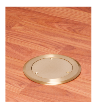
3 Install the blank cover in unused boxes to avoid possible trip hazard.

2 Secure the leveling ring assembly to the installed FLBC4500 can with PVC cement.